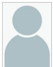
Position Vacant Secretary